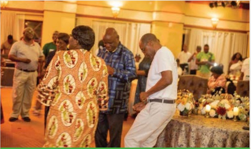
Judges takes to the dance floor during the JSC Leadership Indaba in Victoria Falls recently

Even when he finally left the stage, people were still clamouring for more. They had indeed been taken down the memory lane.