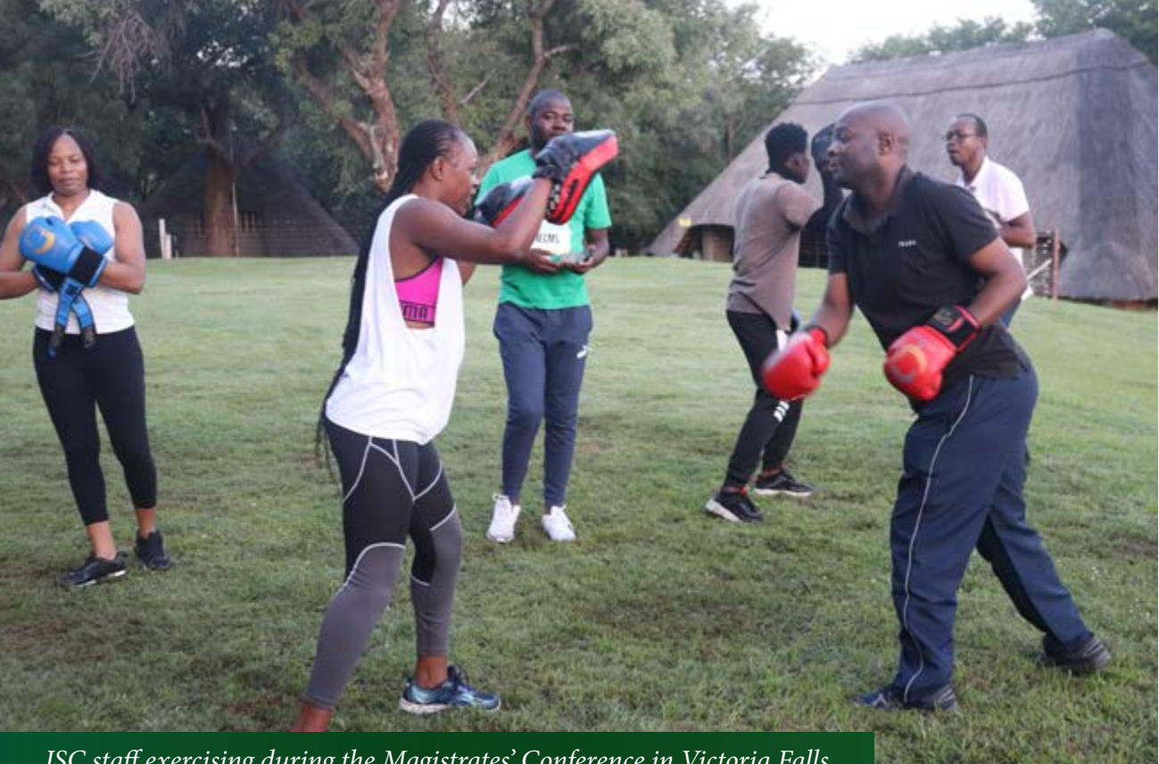
JSC staff exercising during the Magistrates' Conference in Victoria Falls