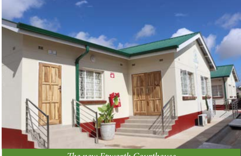
The new Epworth Courthouse