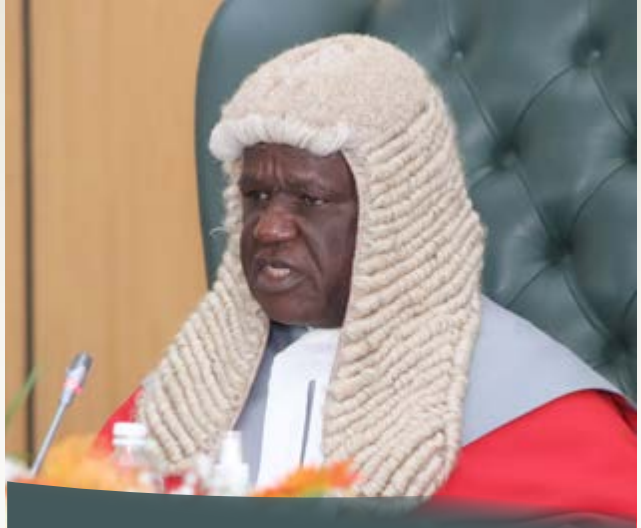
Chief Justice Hon. L. Malaba