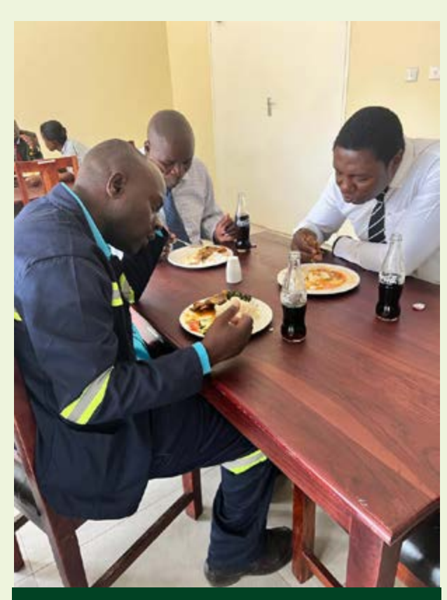
Picture collage shows staff at Chinhoyi Court Complex having lunch at the new canteen