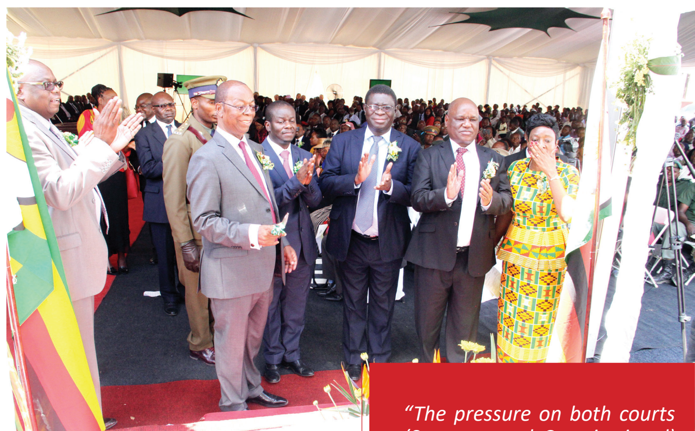
Celebrations at the launch of the strategic plan