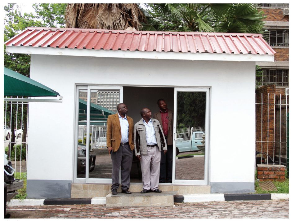
The drivers' rendezvous at the Supreme Court.

"When we were still at the Old Supreme Court Building, we had an office but our relocation to Mashonganyika Building had left us exposed to all kind of weather."